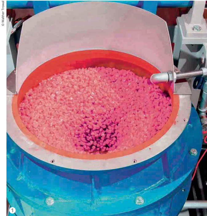
Figure 1: During the mass finishing process the lining of the work bowl is subject to considerable wear.

a new digital manufacturing control system pass-through times could be significantly reduced resulting in much faster deliveries. Of course, the fact that all casting moulds for the various machine types and sizes are in stock and, therefore, immediately available, also helps expediting turnaround times. Klaus Peter Dose, service manager at Walther Trowal, explains that the refurbishment work is not limited to new wear linings: "If necessary, within the scope of our exchange program we also replace worn machine components. In regular intervals the work bowls are passing through a recycling phase and, therefore, do not have to be scrapped - a prime example for resource saving sustainability in our industry."